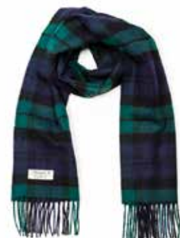
526 Black Watch Tartan