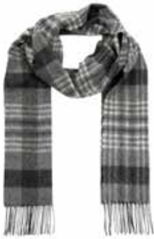
1923 Grey Charcoal Silver Block Check