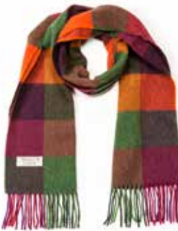
247 Maroon Green Block Check