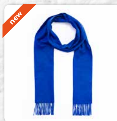
475 Royal Blue