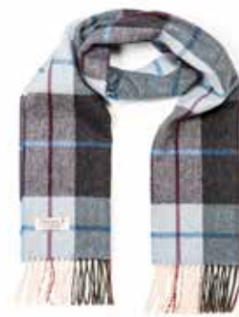
212 Light Blue Charcoal Check