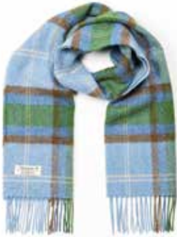
280 Light Blue Green Check