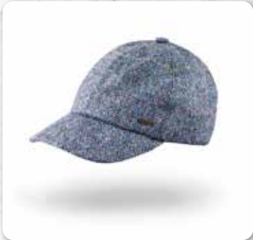
BC H84 Grey Denim Herringbone