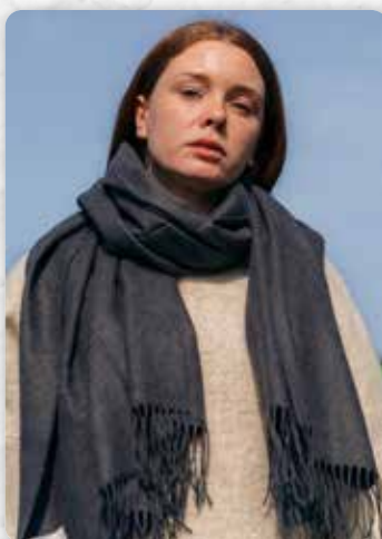
784 Solid Charcoal