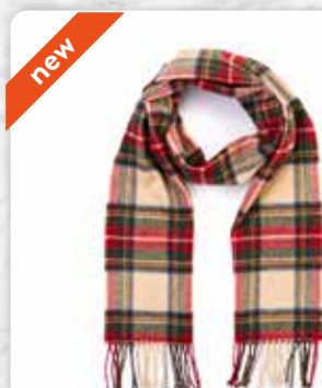
501 Antique Dress Stewart