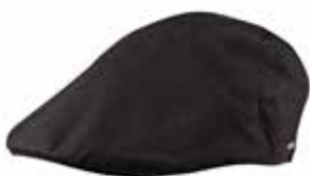
SC Black Black