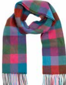
249 Tabasco Blue Purple Green Block