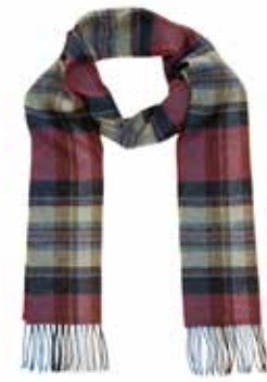
230 Red Straw Graphite Plaid