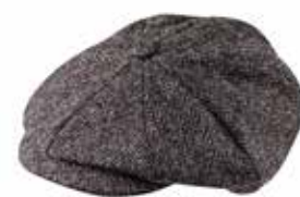
8 PC D41