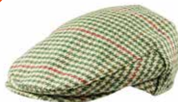
TC H35 Green Beige Houndstooth