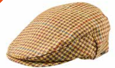
TC H37 Brown Beige Houndstooth