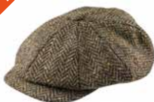
8 PC H14