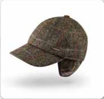
BC H58 Dark Green Black Herringbone