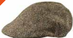
SC H14 Brown Green Donegal Herringbone