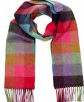
248 Navy Blue Jade Bronze Block