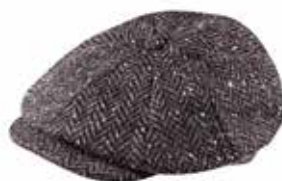
8 PC D20