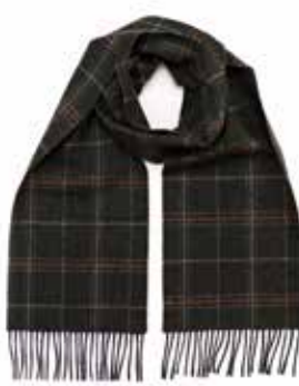
1944 Green Rust Grey Check