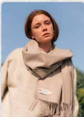
783 Solid Sand