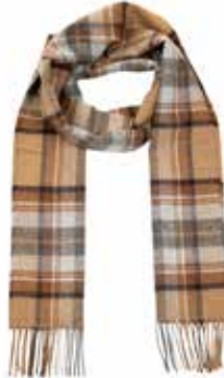
1959 Silver Beige Grey Plaid