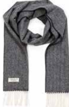
1998 Charcoal Herringbone