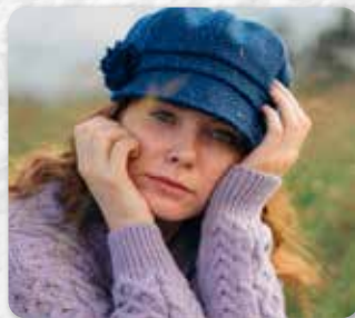
Una B Royal Blue Navy Herringbone Donegal