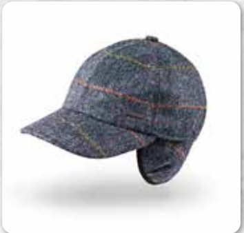
BC H57 Charcoal Denim