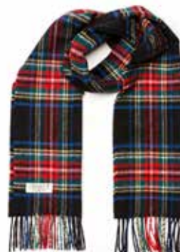
578 Black Stewart