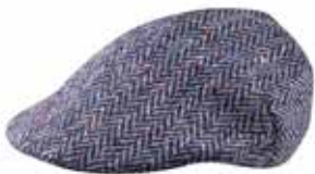
SC H27 Navy Herringbone Donegal