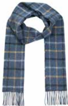
237 Grey Beige Blue Black Overcheck