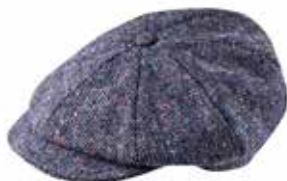
8 PC H30