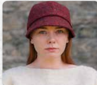
Eve C Red Deep Purple Herringbone Donegal