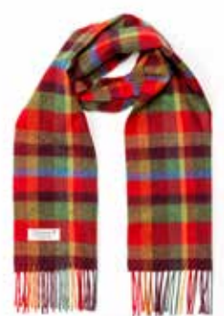
211 Red Green Yellow Check