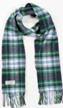
551 Dress Gordan