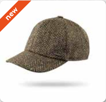
BC H14 Brown Green Donegal Herringbone