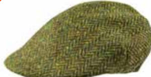
SC H15 Moss Green Donegal Herringbone