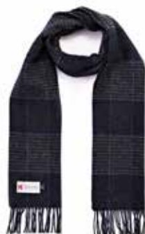
565 Charcoal Indigo Glencheck