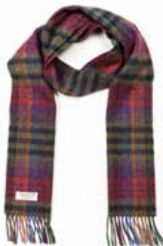
1943 Green, Mustard and Purple Check