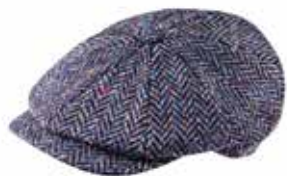
8 PC H27

This eight piece cap made famous in Peaky Blinders is the classic Newsboy Cap also known as the Gatsby Cap.