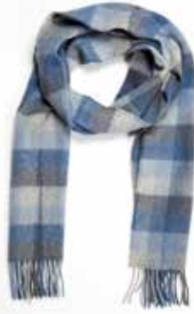
1967 Blue Grey Block Check