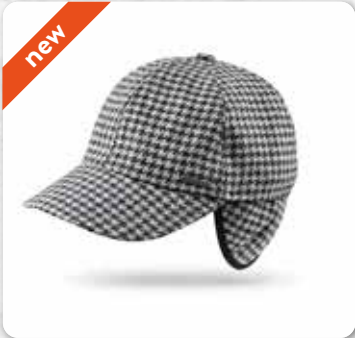
BC H11 Black & White Houndstooth