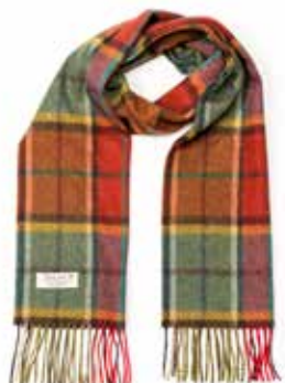
231 Autumnal Mix Check