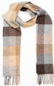
1948 Beige Brown Grey Herringbone