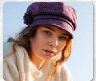
Una D Pink Deep Purple Herringbone Donegal