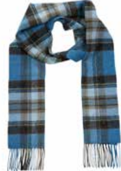
205 Blue Royal Sage Plaid