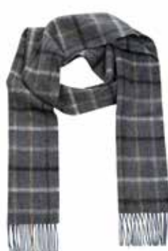
239 Denim Beige Blue Black Overcheck