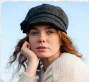
Una A Brown Turquoise Herringbone Donegal

(Ladies Hats are available in sizes – S/55/6¾, M/57/7 & L/59/7¼)