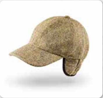
BC J5 Beige Green Herringbone