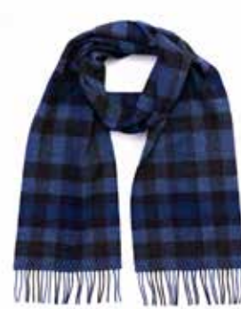
1928 Denim Grey Navy Check