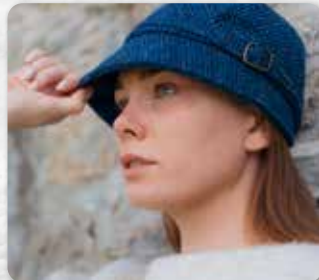
Eve B Royal Blue Navy Herringbone Donegal