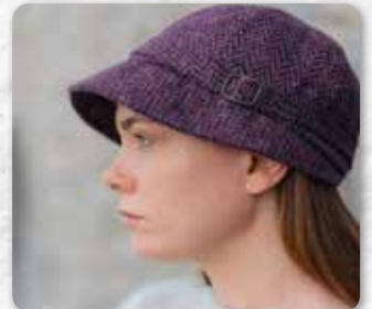
Eve D Pink Deep Purple Herringbone Donegal