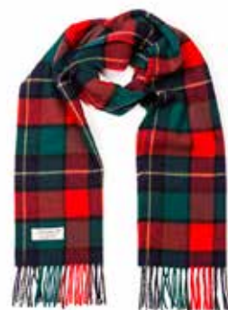
548 Kilgore Tartan