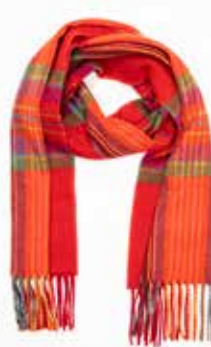
207 Red Orange Plaid