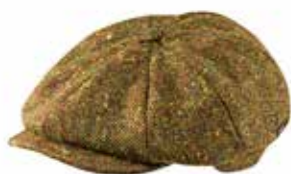
8 PC H36