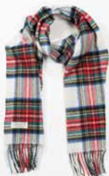
549 Dress Stewart Tartan