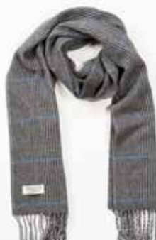
533 Light Grey Charcoal Stripe