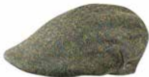
SC D58 Dark Green Solid