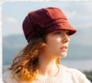
Una C Red Deep Purple Herringbone Donegal