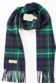
504 New Green and Yellow Tartan