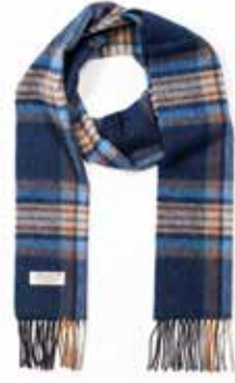
1974 Orange and Denim Check