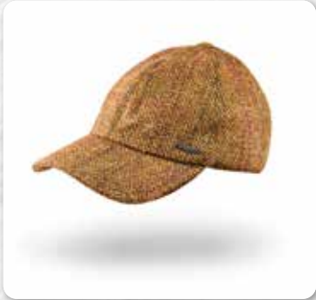
BC H56 Tan Brown Herringbone