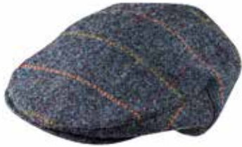
TC H57 Charcoal Denim