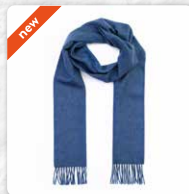
472 Denim Blue