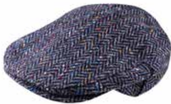
TC H27 Denim Navy Herringbone Donegal