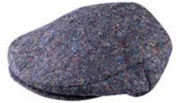
TC H30 Navy Plain Donegal