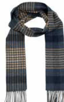
1912 Denim Navy Beige Block Check