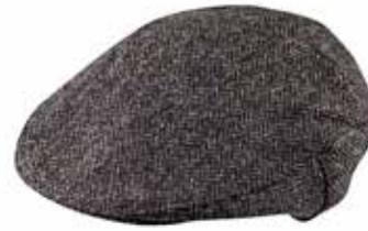
TC D41 Charcoal Black Herringbone