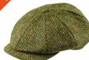
8 PC H15