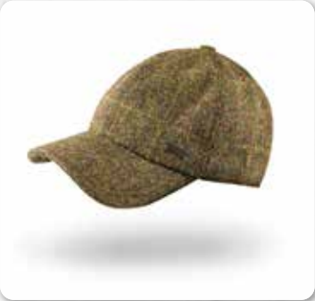
BC H65 Loden Rust