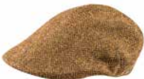
SC H16 Beige Dark Brown Herringbone