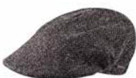
SC D41 Charcoal Black Herringbone