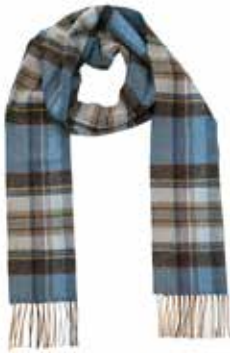
1956 Blue Charcoal Sage Plaid