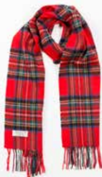
550 Red Royal Stewart Tartan