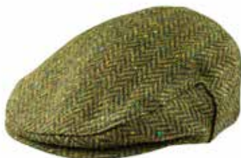
TC H15 Moss Green Donegal Herringbone