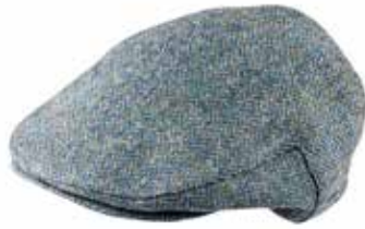
TC H74 Mid Blue Green Herringbone