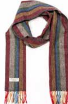
1955 Beige Red Mustard Stripe