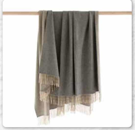
4004 Grey Beige