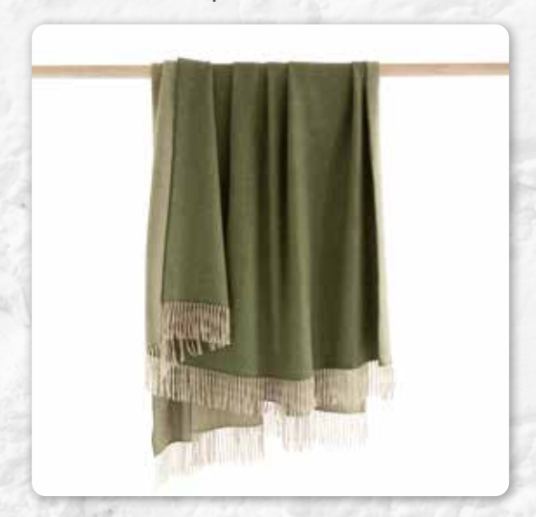
4002 Green Beige

Wool Angora Throw 75% SuperfineWool, 25% Caregora Angora - 136 x 190cms (54" x 71")