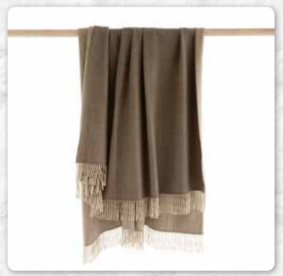
4003 Brown Beige