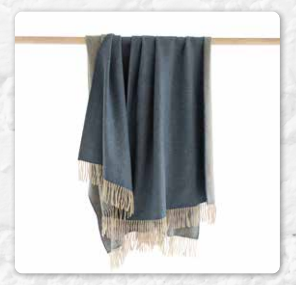
4005 Blue Beige