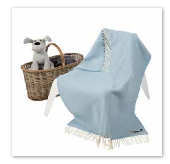
BB19 Baby Blue