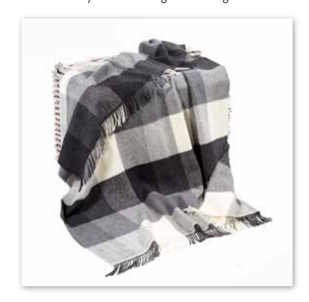
1486 White Grey Herringbone Block Check