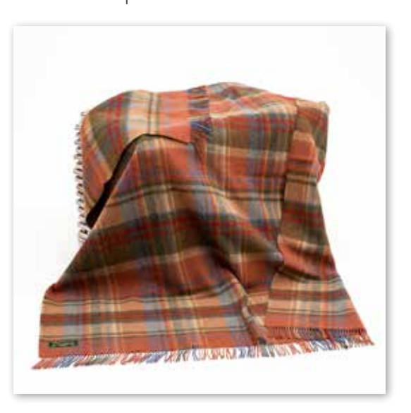
LW153 Brown Orange and Blue Plaid