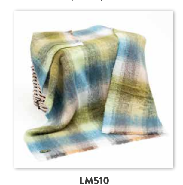
Cream, Pale Blue, Pale Green & Grey Mix Block Check