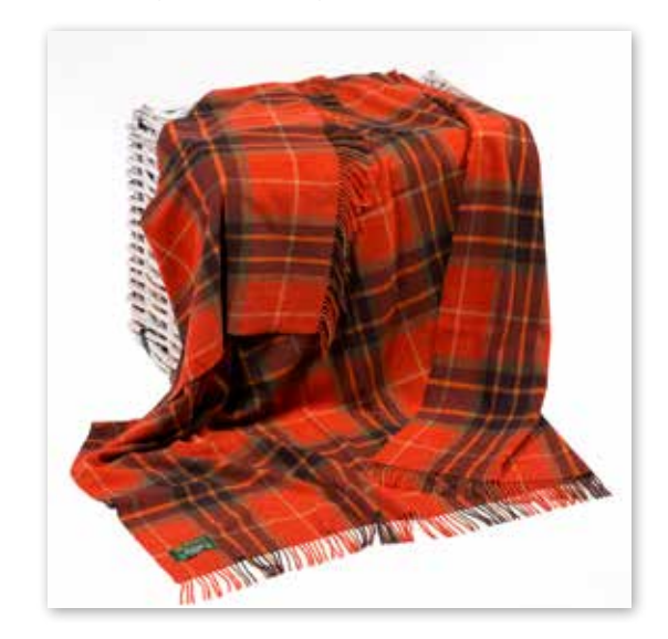
633 Orange Tartan Mix