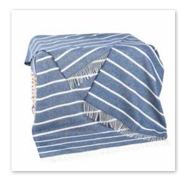
3149 Denim White Horizontal Stripe