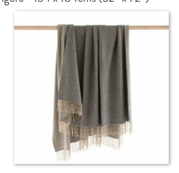
4004 Grey Beige