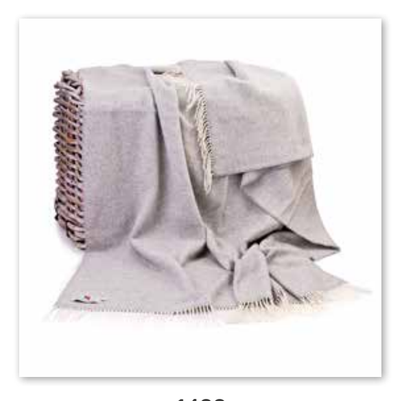
1488 Pale Grey Cream Herringbone