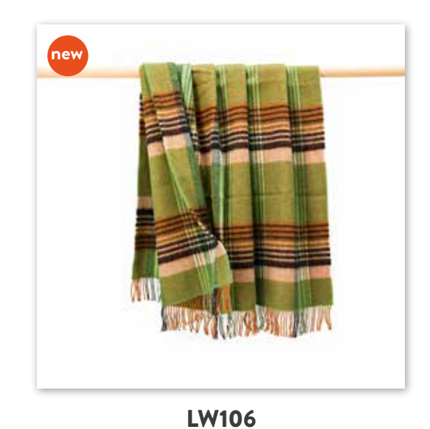
Green Orange Charcoal Cream Plaid