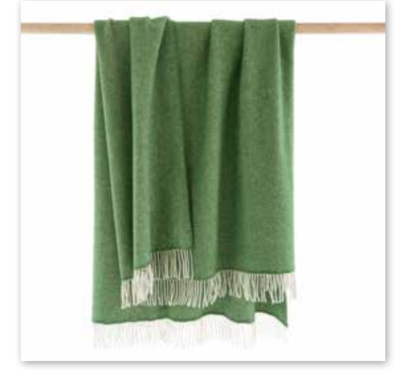
1491 Green Herringbone