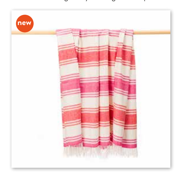
3164 Pink Orange White Stripe