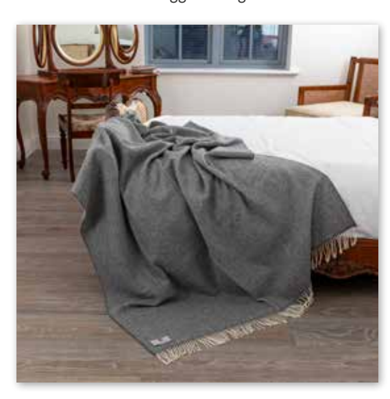
9000 Grey Herringbone