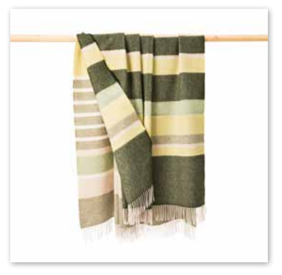
3160 Green Stripe