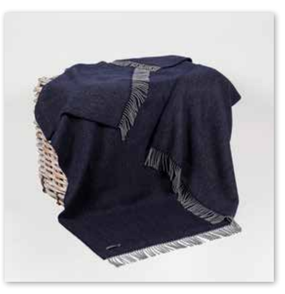
1408 Dark Navy Herringbone