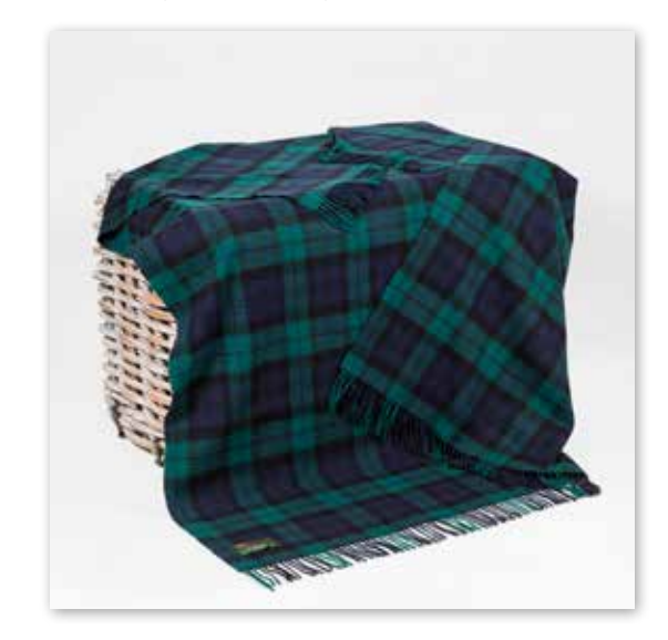
620 Black Watch Tartan