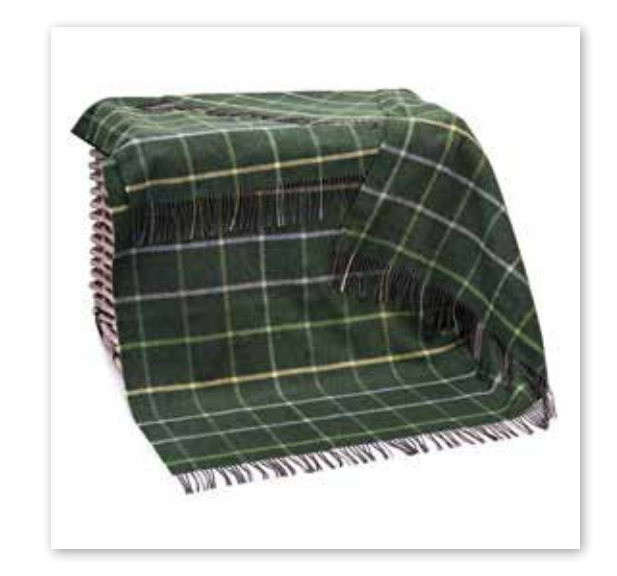
3155 Green Windowpane