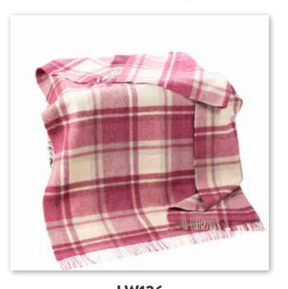
LW126 Natural Pink Mix Plaid