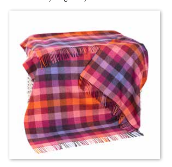
622 Pink Peony Viola Orange Multi Check