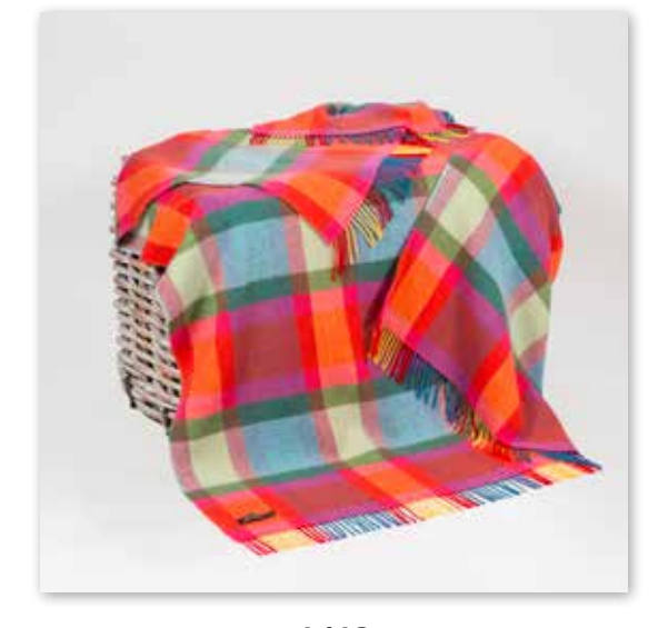
1418 Bright Yellow Pink Blue and Green Check