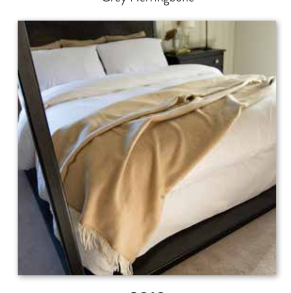
9010 Beige Herringbone