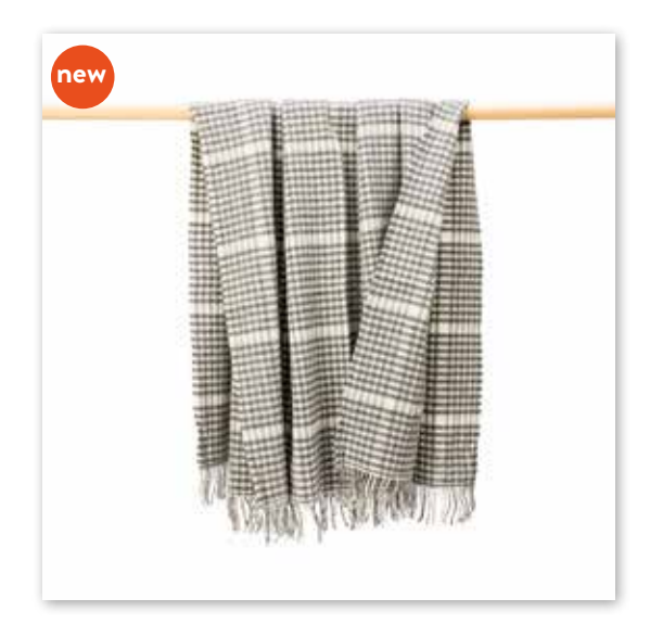
1428 Grey White Herringbone Check