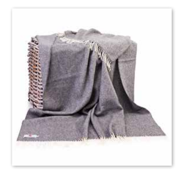
1474 Grey Herringbone