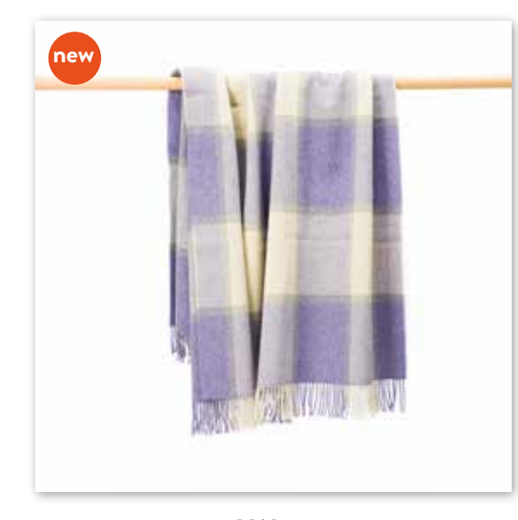
LW117 Lavender White Silver Block