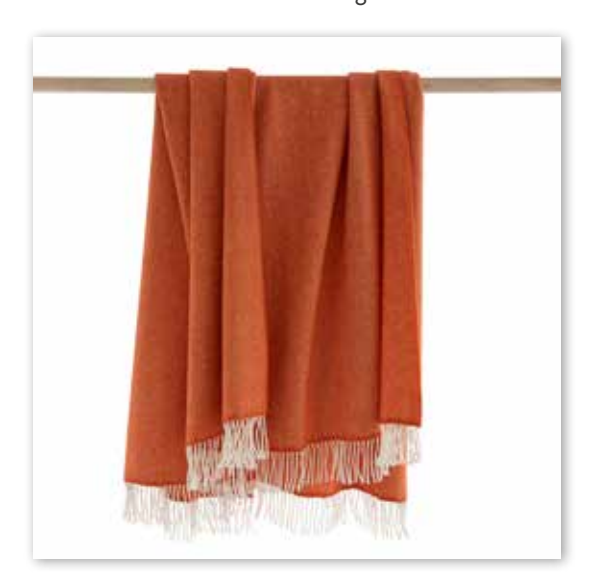
1437 Orange Bronze Herringbone