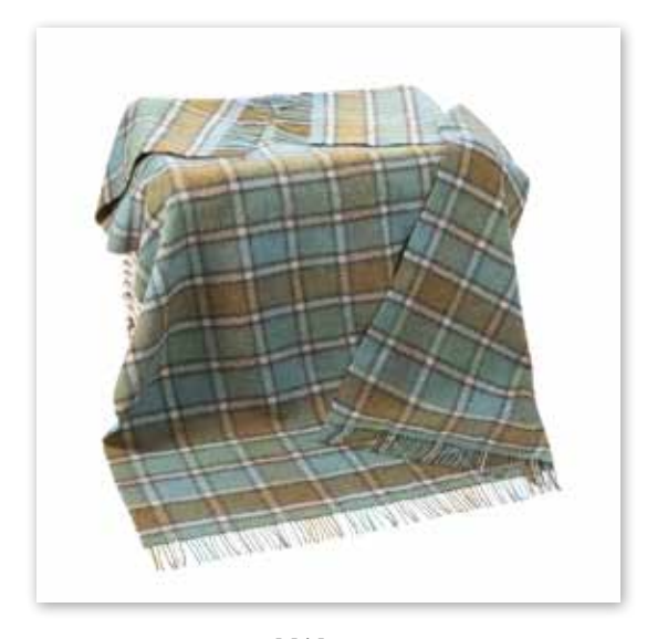
LW120 Lichen Sea Green and Beige Plaid