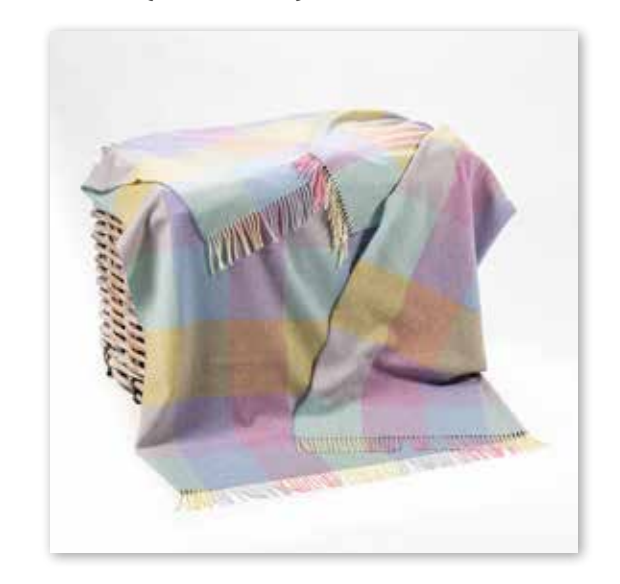
615 Pink Blue Yellow Lilac Block Check