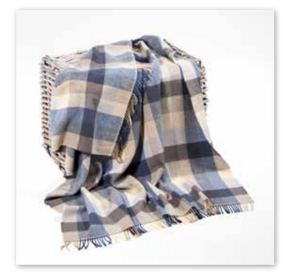
1484 Denim & Cream Grey Small Block Check