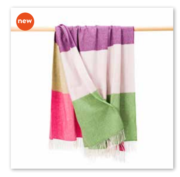
3163 Pink Green Purple Herringbone Stripe