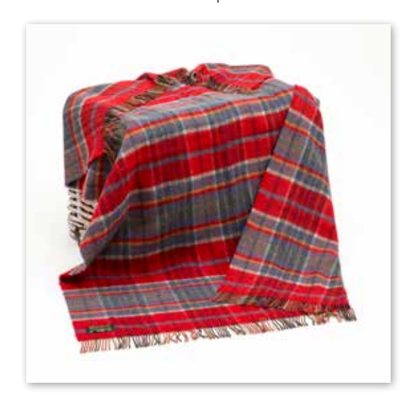
LW180 Orange Red Midnight Blue Plaid