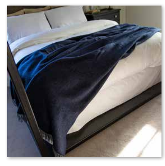
9007 Dark Navy Herringbone