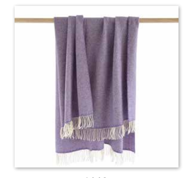
1440 Lavender Purple Herringbone