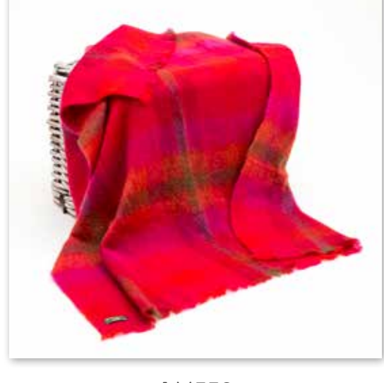
LM552 Bright Red and Pink Check