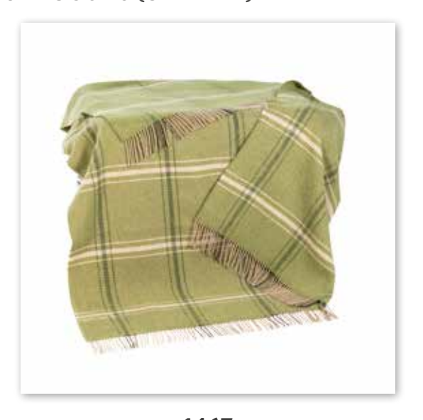
1467 Green Beige Cream Overcheck