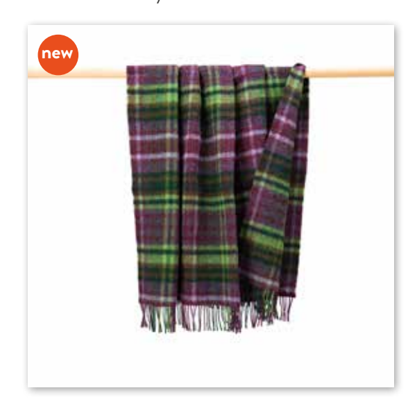
LW103 Purple Green Lavender Plaid