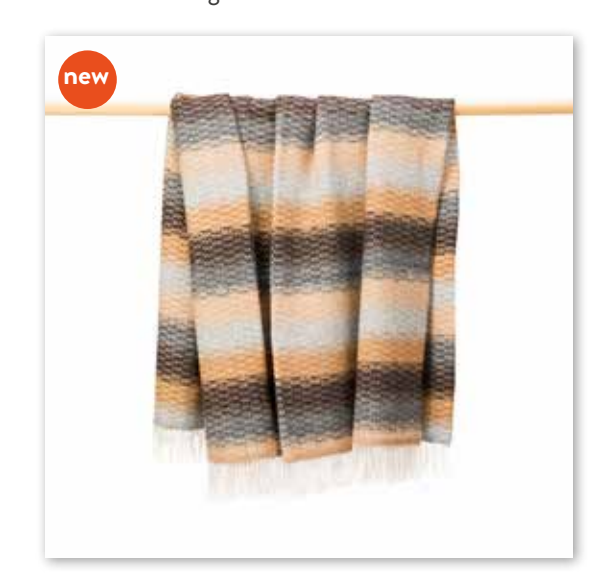
1452 {\sf Camel\ Grey\ Brown\ Stone\ Diffused\ Stripe\ Textured\ Twill}