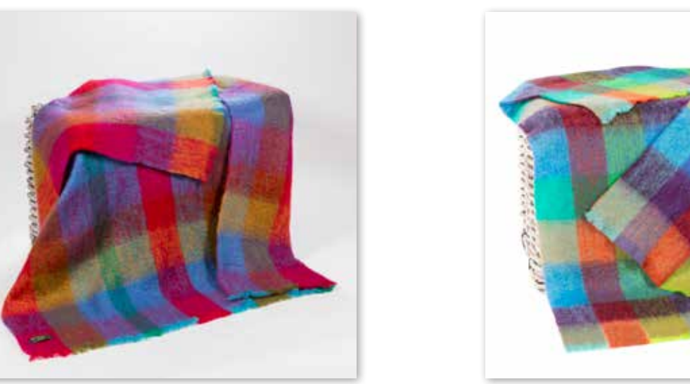
LM596 Bright Pink Mustard Purple and Aqua Block Check