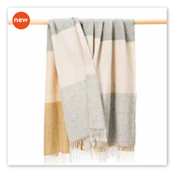
3162 Camel Beige Grey Herringbone Stripe