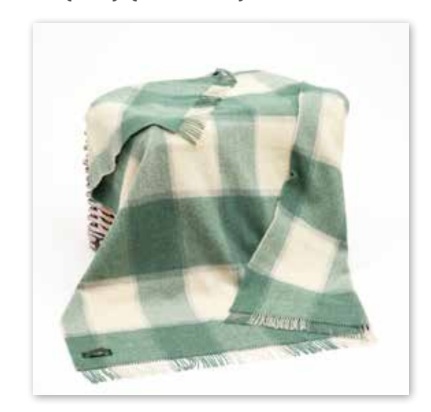
LW164 White Sea Green Block