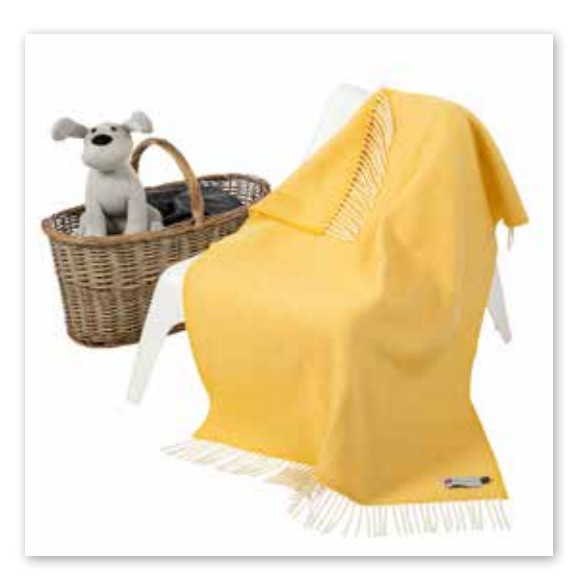
BB18 Baby Yellow