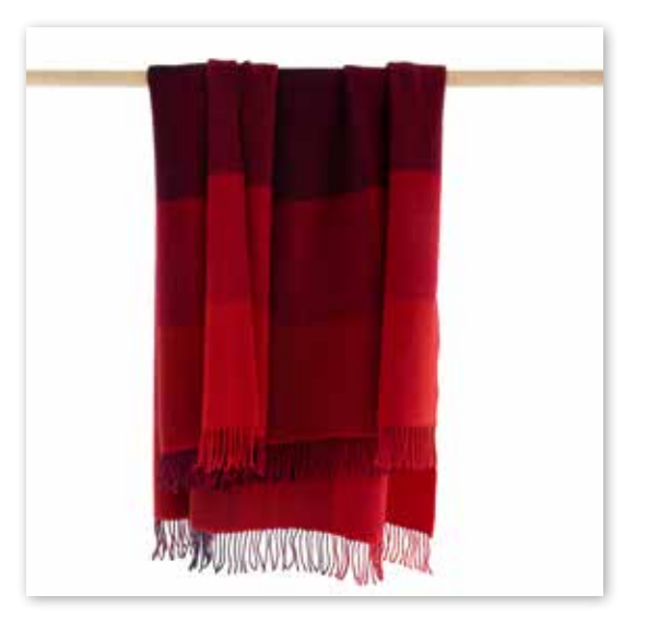
1441 Red Wine Burgundy Blocks