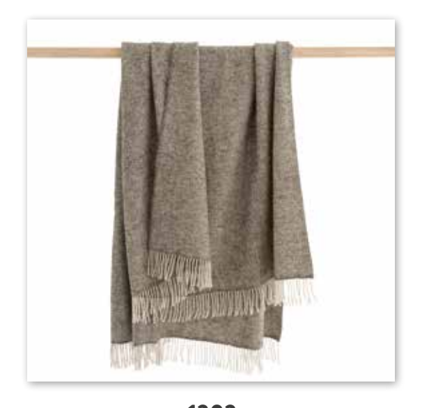
1303 Grey Mix Herringbone