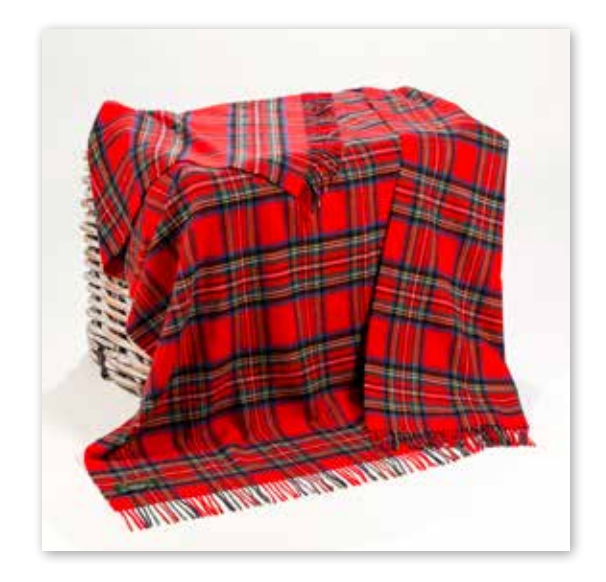
644 Royal Stewart Tartan

100% Lambswool - 137 x 180cms (54" x 71")