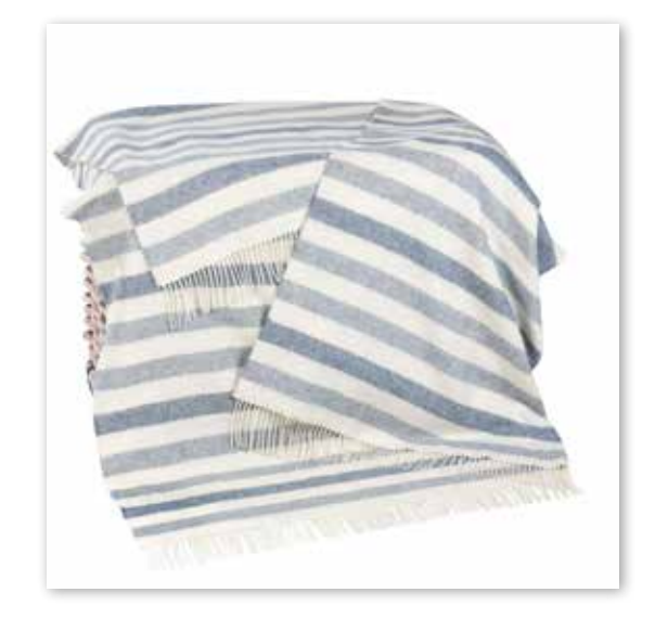
3146 White with Denim Stripe