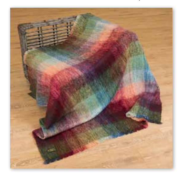
LM502 Watercolour Monet

70% Mohair, 30% Wool - 137 x 182cms (54" x 72")