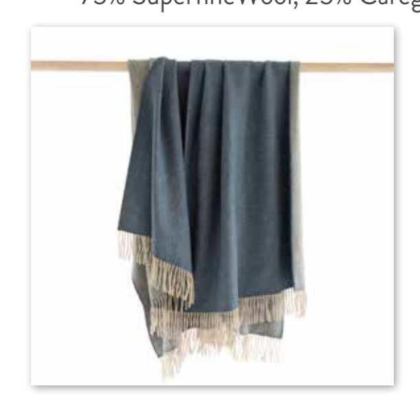
4005 Blue Beige