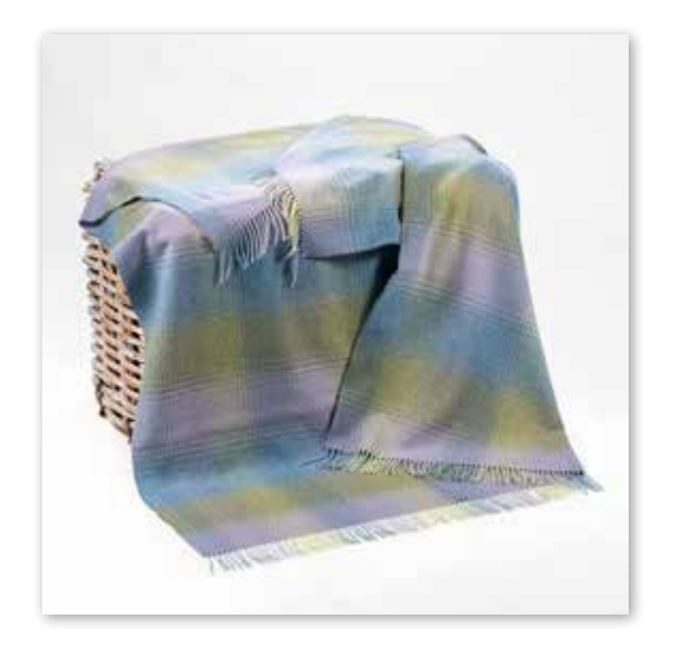
634 Blue Green Lilac Herringbone Check

100% Lambswool - 137 x 180cms (54" x 71")