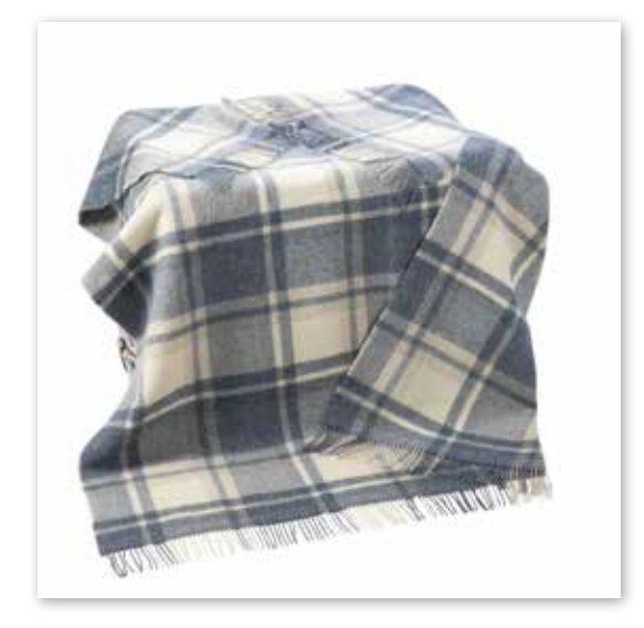
LW124 Natural Denim Blue Mix Plaid