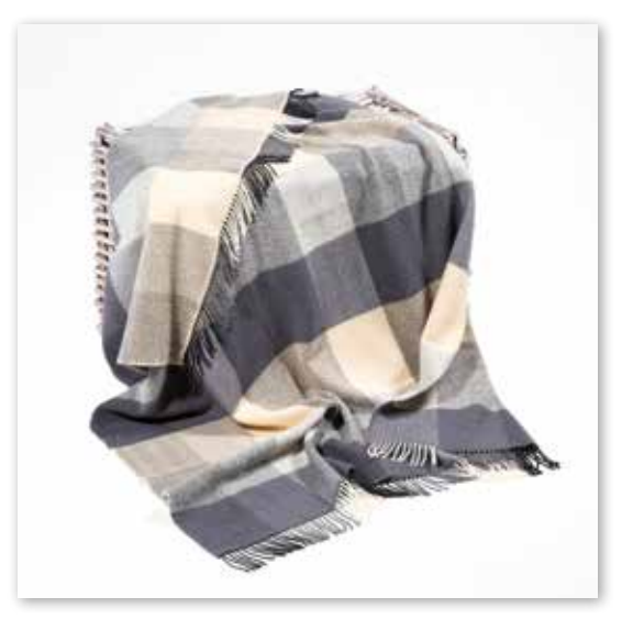
1485 Cream Grey Large Block Herringbone