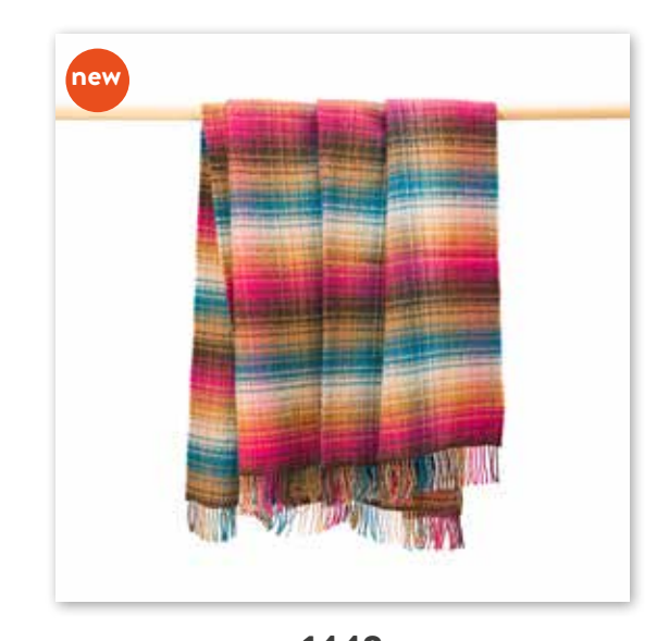
1448 Pink Orange Teal Camel Brown Cream Check