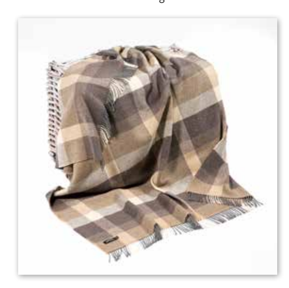
1413 Beige Cream Check