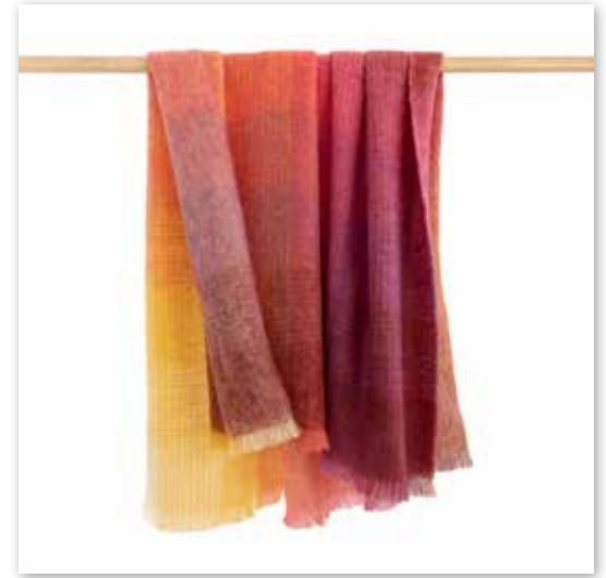
LM509 Pink Yellow Purple Multi Mix

70% Mohair, 30% Wool - 137 x 182cms (54" x 72")