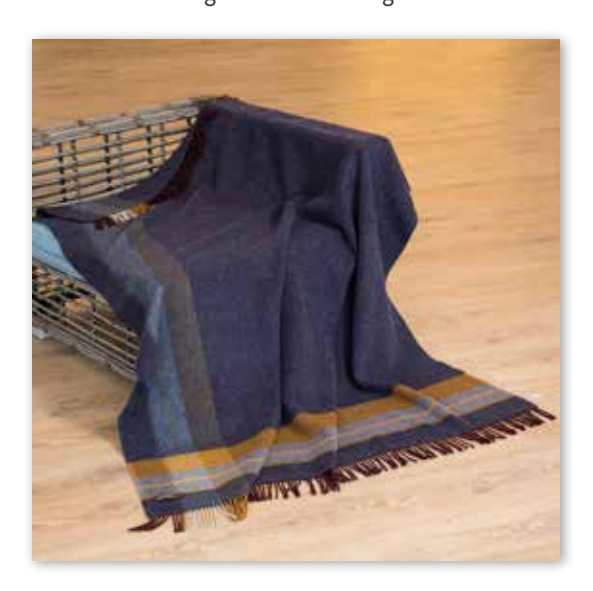
1461 Navy & Mustard Asymmetrical