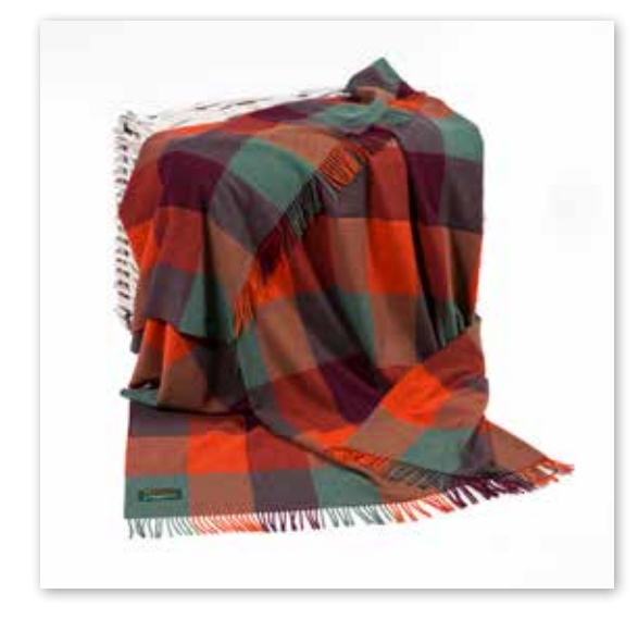
642 Orange Maroon Sea Green Block