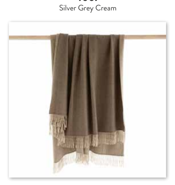
4003 Brown Beige