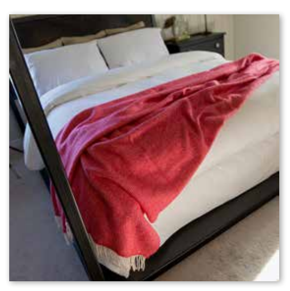
9002 Raspberry Herringbone