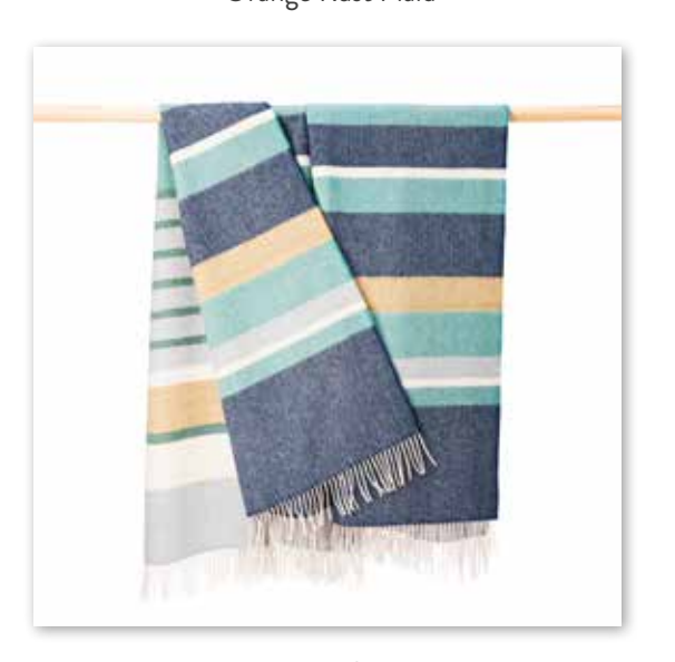
3159 Blue Stripe