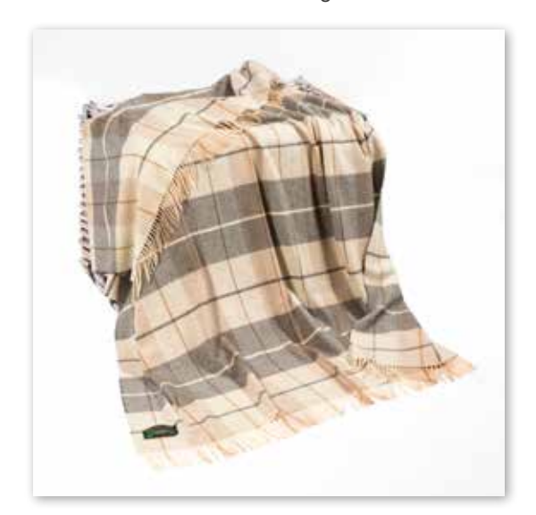
629 Cream and Brown Tartan Mix