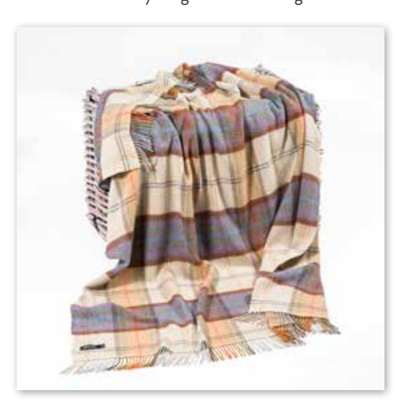
1458 Grey Mustard Plaid