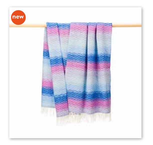
1450 Blue Lavender Purple Diffused Stripe Textured Twill

95% Merino 5% Cashmere - 136 x 180cms (54" x 71")