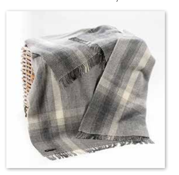
1489 Grey Silver Border Check