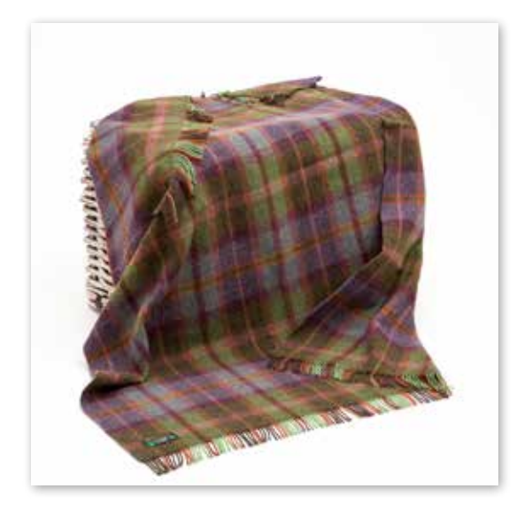
LW187 Green and Purple Mix Plaid