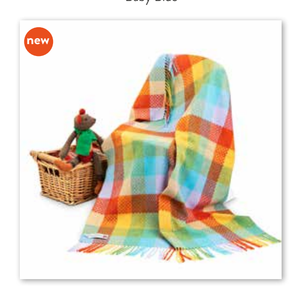
BB21 Multicolour Basket Weave