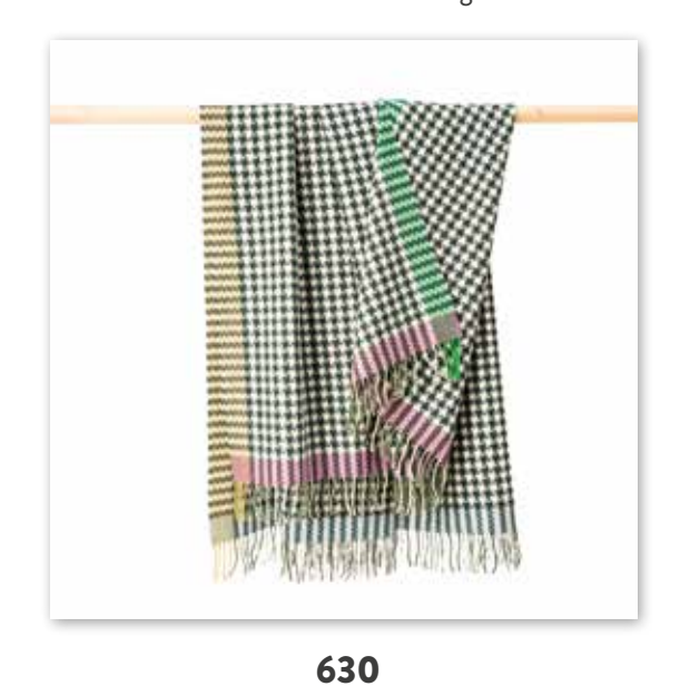
Cream Green Blue Small Block