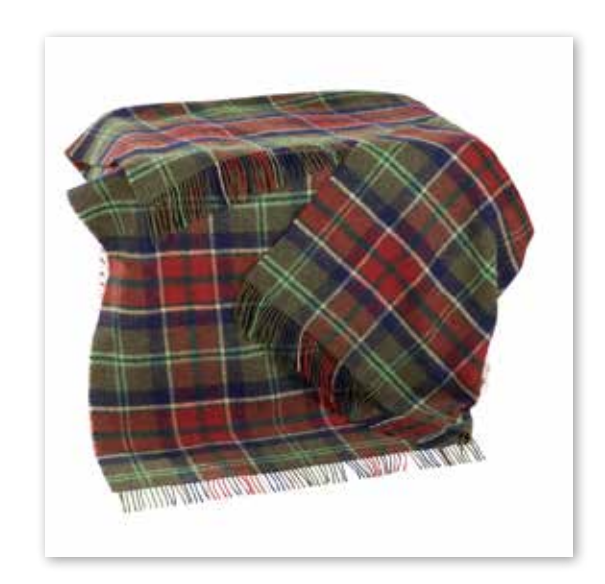
LW116 Loden Navy Claret Plaid