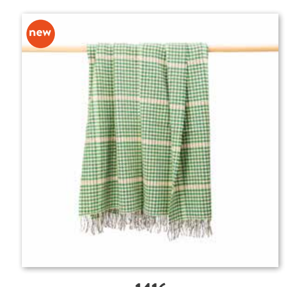
1416 Green Cream Herringbone Check