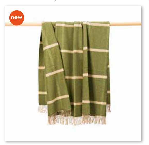
4010 Green Cream Windowpane Check

Wool Angora Throw 75% SuperfineWool, 25% Caregora Angora - 134 x 184cms (52" x 72")