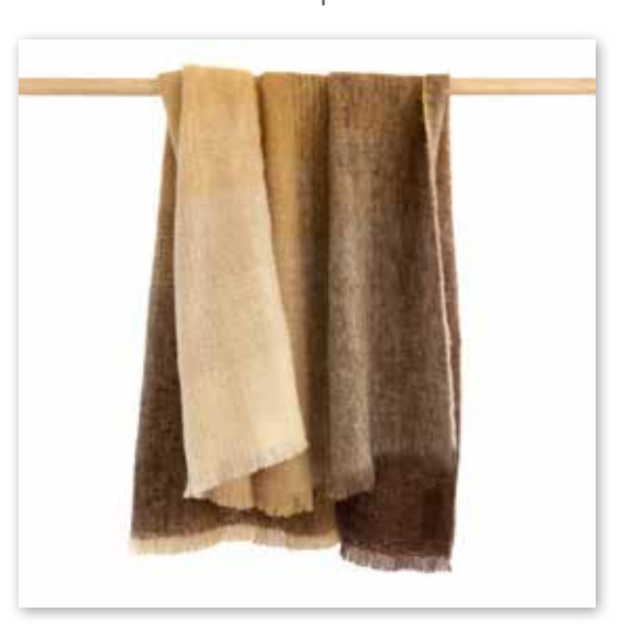
LM508 Brown Tan Beige Mix