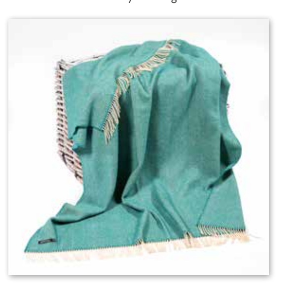
1417 Green Aqua Herringbone