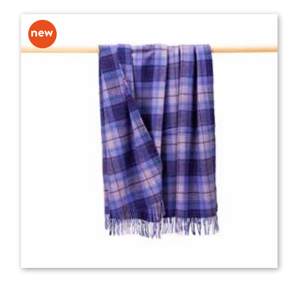
607 Lavender Purple Violet Blue Check

100% Lambswool - 137 x 180cms (54" x 71")