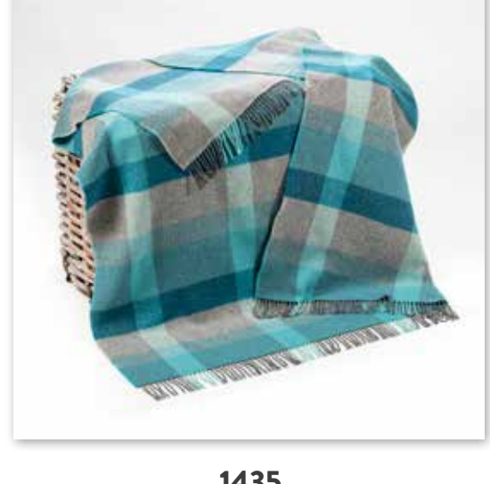
1435 Grey Duck Egg Aqua Teal Check