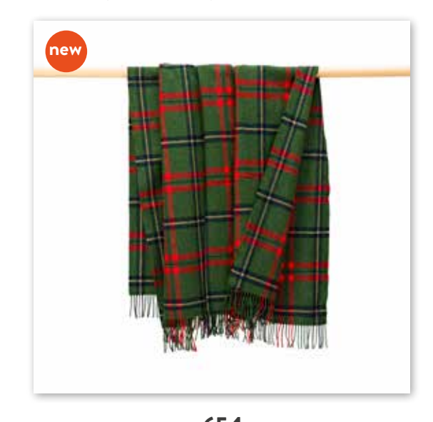
654 Green Red Navy Blue Check