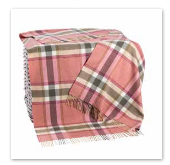
651 Pink Beige Loden Guard Check