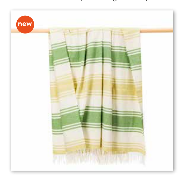
3165 Lime Green White Stripe