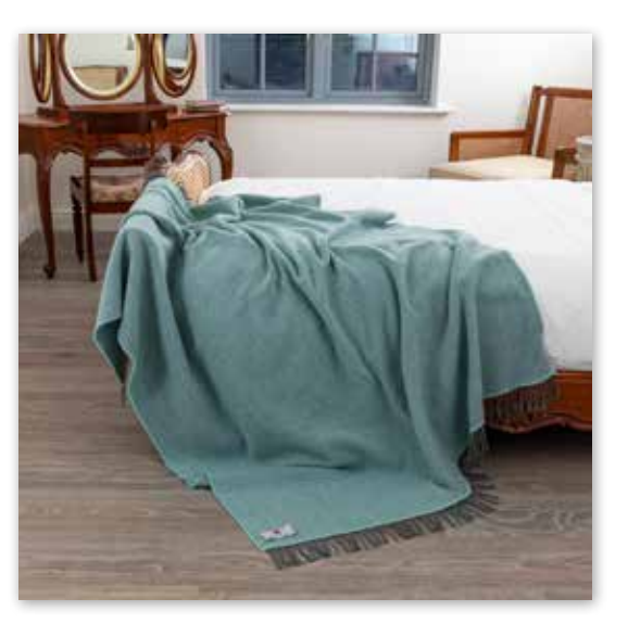
9003 Duck Egg Herringbone