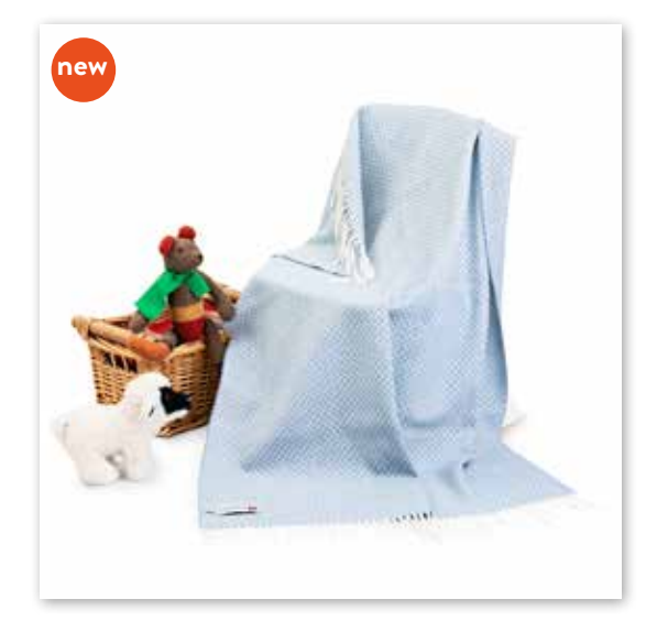
BB23 Blue Basket Weave