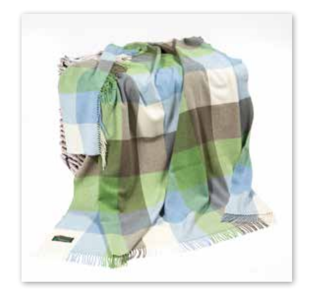
614 Cream Baby Blue and Green Block Check

100% Lambswool - 137 x 180cms (54" x 71")