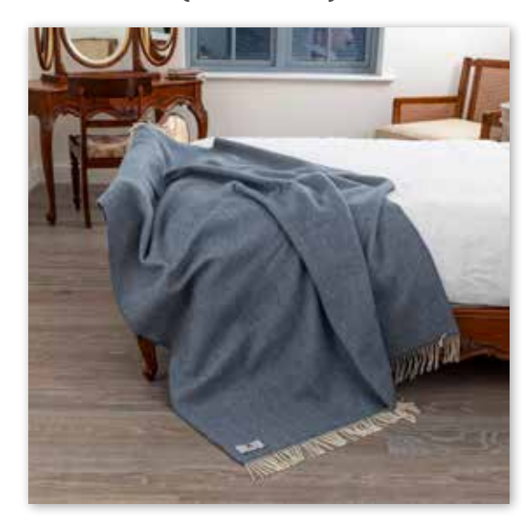
9005 Denim Cream Herringbone