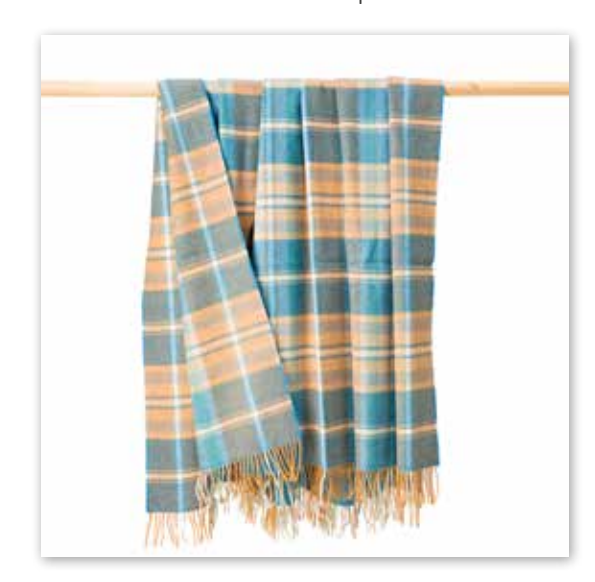
3158 Blue Orange Plaid