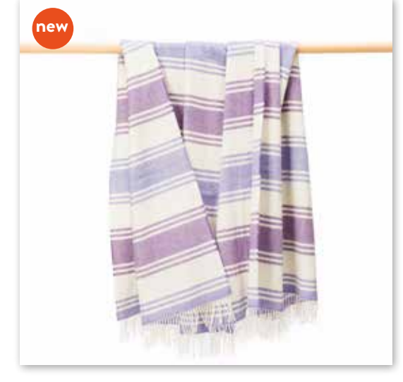
3166 Lilac Purple White Stripe