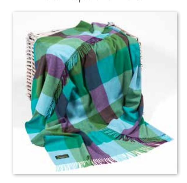
646 Green Blue Marine Block Check