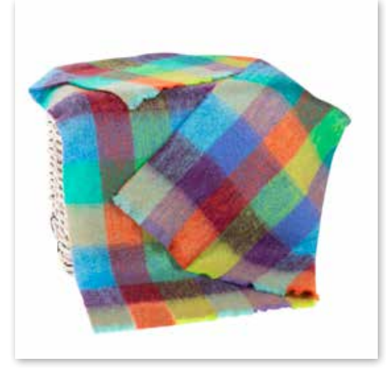
LM536 Purple Green Poppy Block