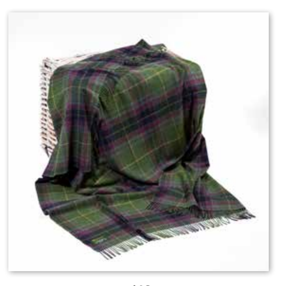
613 Green Navy Purple Plaid