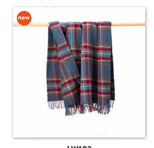
LW102 Denim Blue Rust Red Plaid