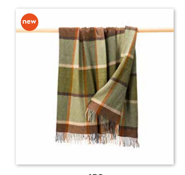
658 Green Brown Orange Cream Check