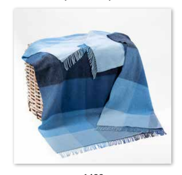
1422 Blue Mix Herringbone Block