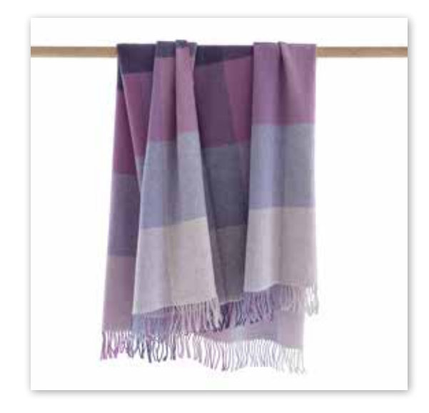
1442 Purple Lavender Lilac Blocks