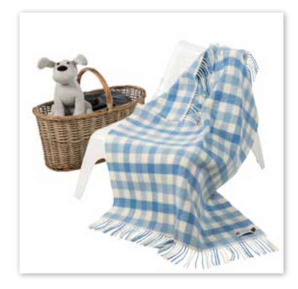
BB15 Blue Block Check