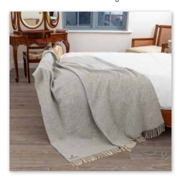
9001 Pale Grey Cream Herringbone