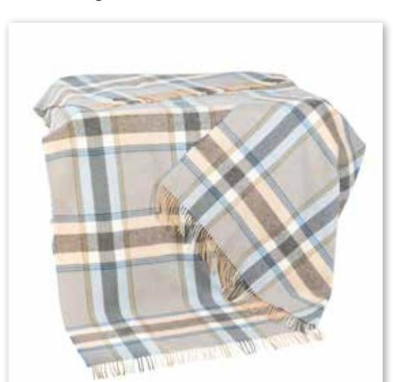
635 Sky Beige Grey Guard Check