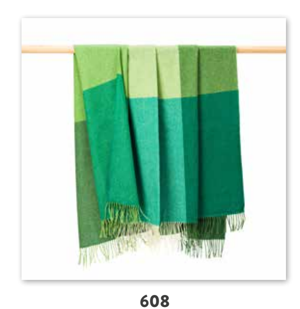
Multi Col Green Large Blocks