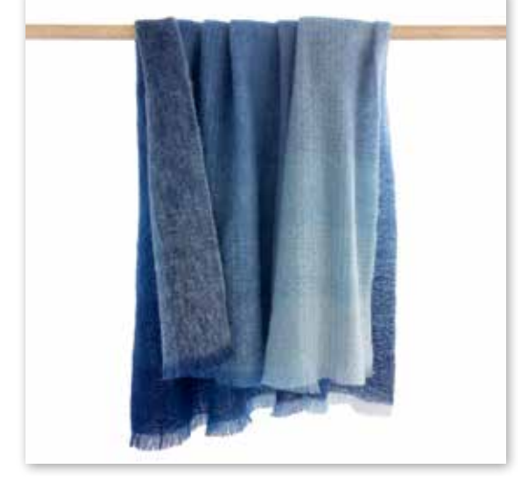
LM505 Multi Col Blues