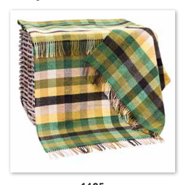
1405 Green Yellow Charcoal Diamond Weave