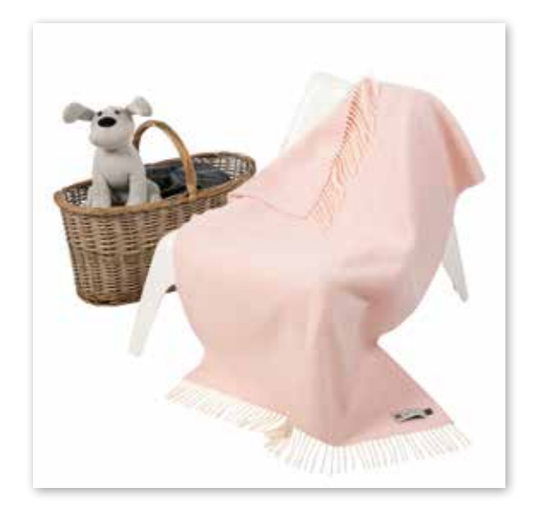
BB17 Baby Pink