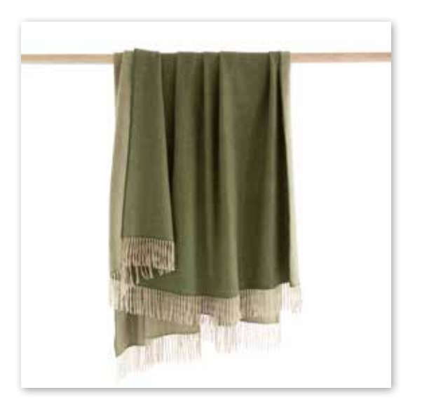
4002 Green Beige