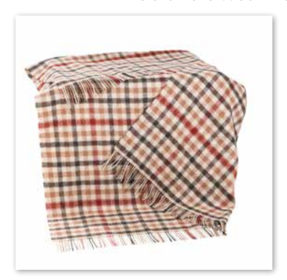
LW115 Beige Rust Red Small Block

100% Pure Wool - 136 x 180cms (LW) (54" x 71")