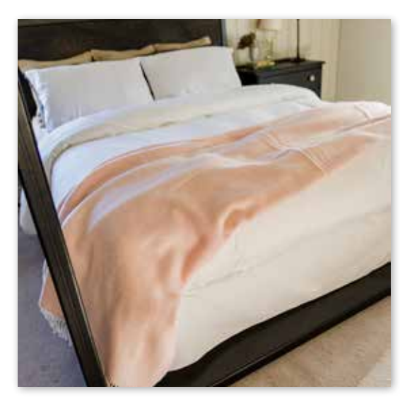
9006 Baby Pink Herringbone