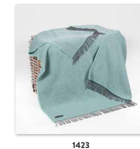
Duck Egg Herringbone