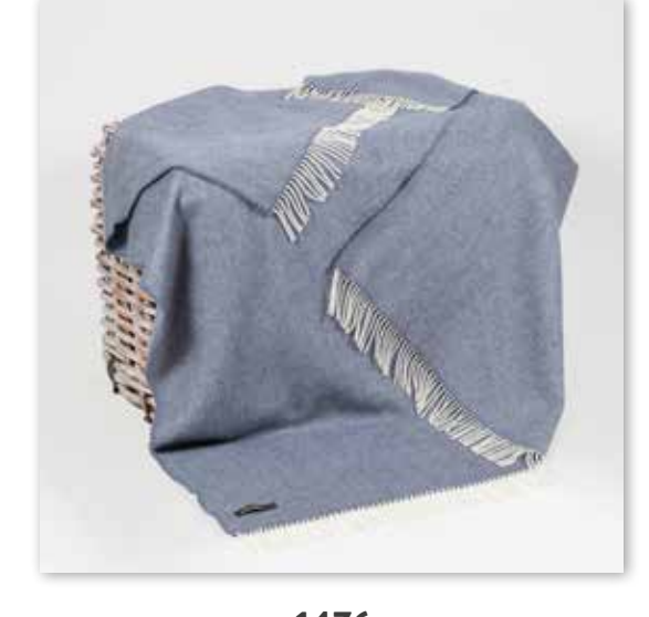
1476 Denim Cream Herringbone