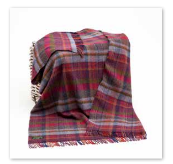
LW134 Raspberry Navy Orange and Pink Plaid

100% Pure Wool - 136 x 180cms (LW) (54" x 71")