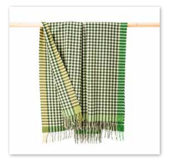
628 Cream Green Small Block