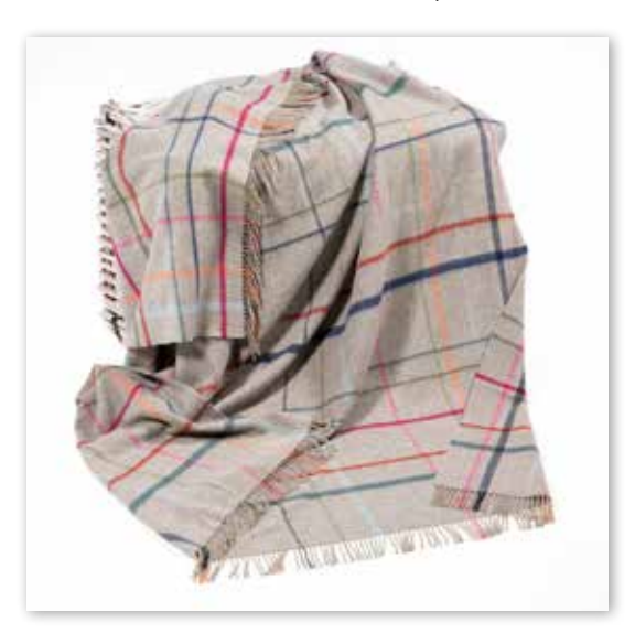
3126 Grey with Multi Colour Window Pane