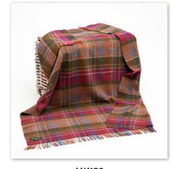
LW152 Raspberry Purple Green and Orange Plaid