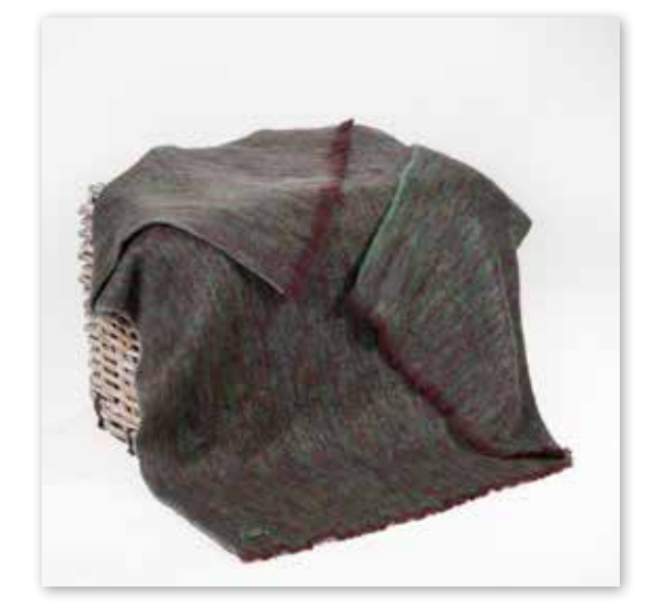
LM520 Dark Purple and Green Plain