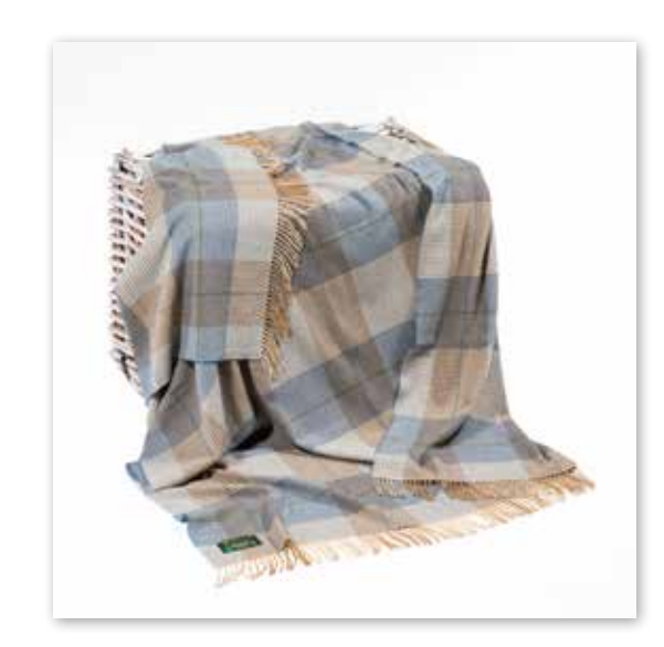
616 Cream Taupe and Denim Check