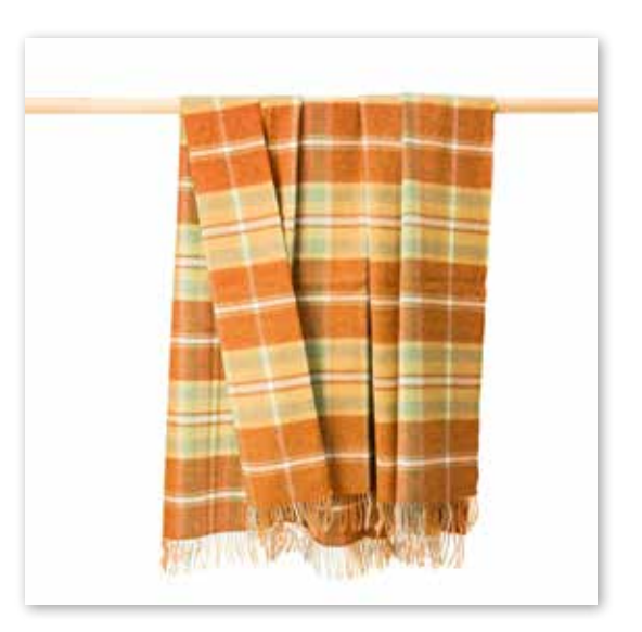
3157 Orange Rust Plaid