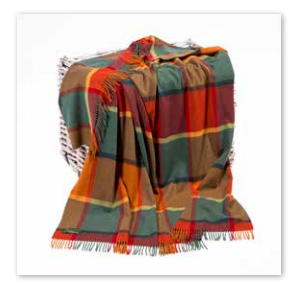
639 Orange Green Yellow and Wine Check

100% Lambswool - 137 x 180cms (54" x 71")