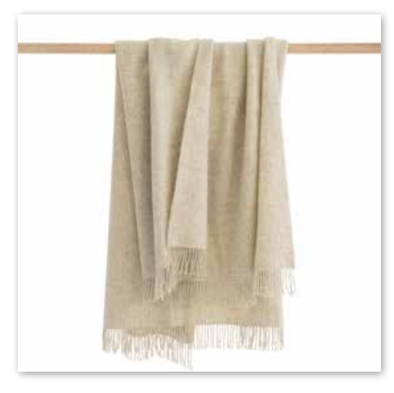
1301 Ecru Herringbone