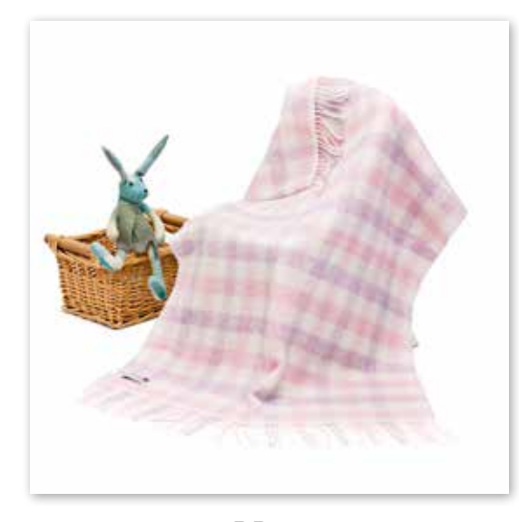
BB20 Baby Pink Lilac Block Check