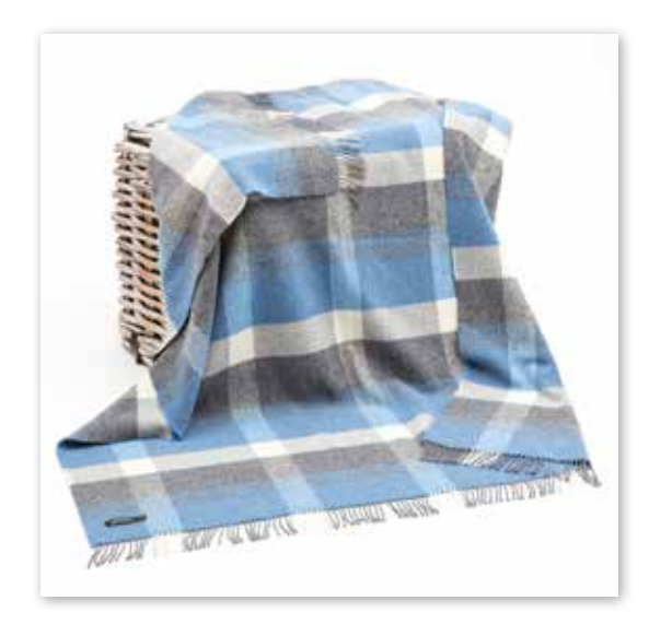
1414 Denim Cream and Pale Grey Check

95% Merino 5% Cashmere - 136 x 180cms (54" x 71")