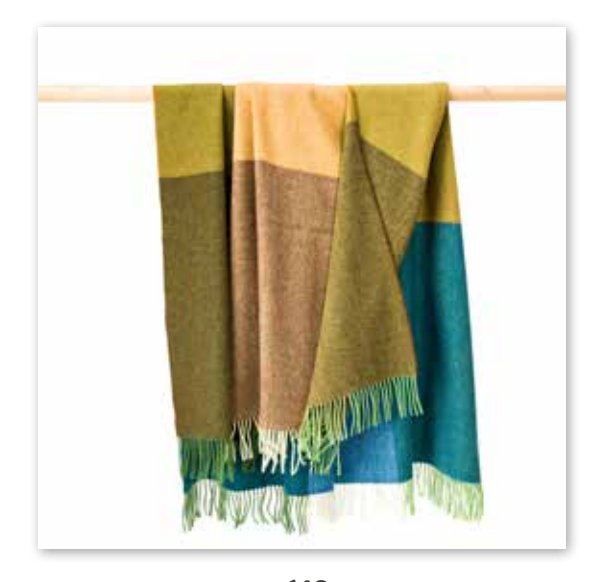
612 Blue Green Mustard Tan Large Blocks