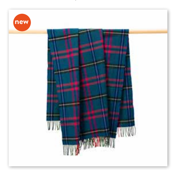
656 Blue Pink Grey Check