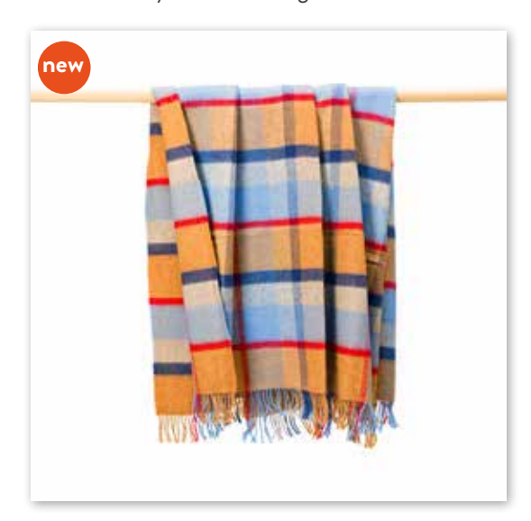
1445 Orange Blue Silver Red Check