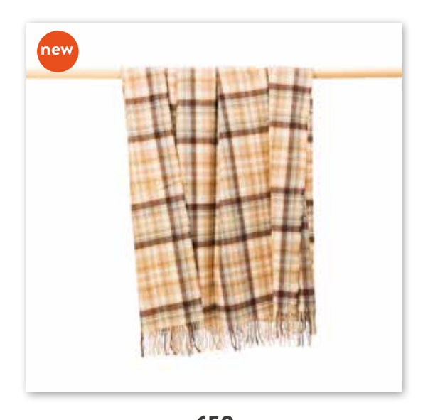
659 Camel Silver Grey Cream Brown Check