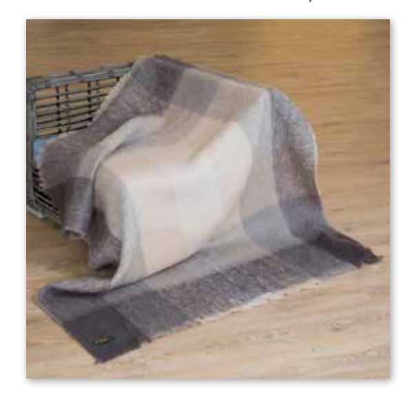
LM517 Beige Grey Large Block