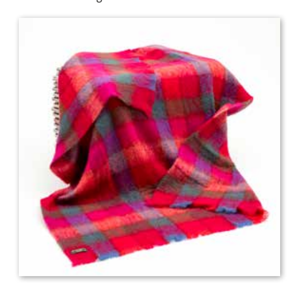
LM575 Bright Orange Red and Blue Check Red Pink Block