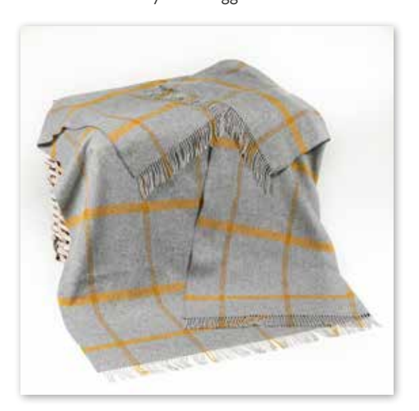
3136 Grey Mustard Check