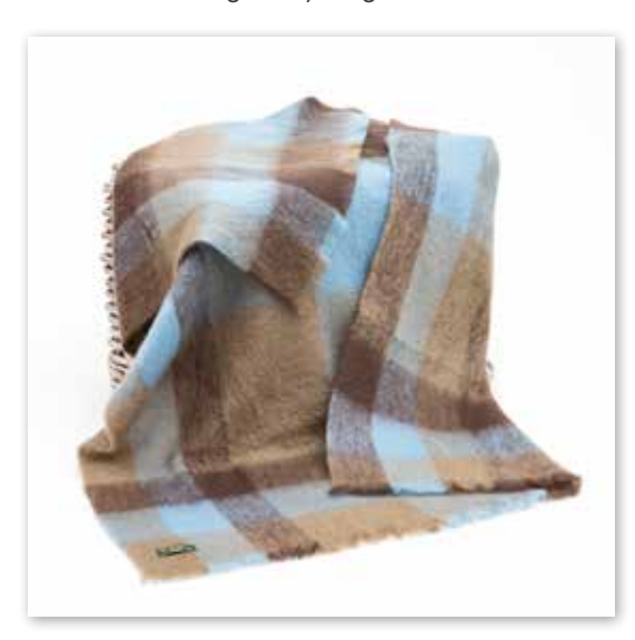
LM550 Taupe Sky Blue and Brown Check