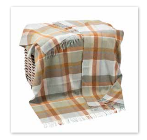
3140 Green Rust Mustard Plaid