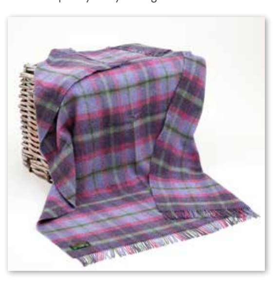
LW188 Purple Pink and Green Plaid