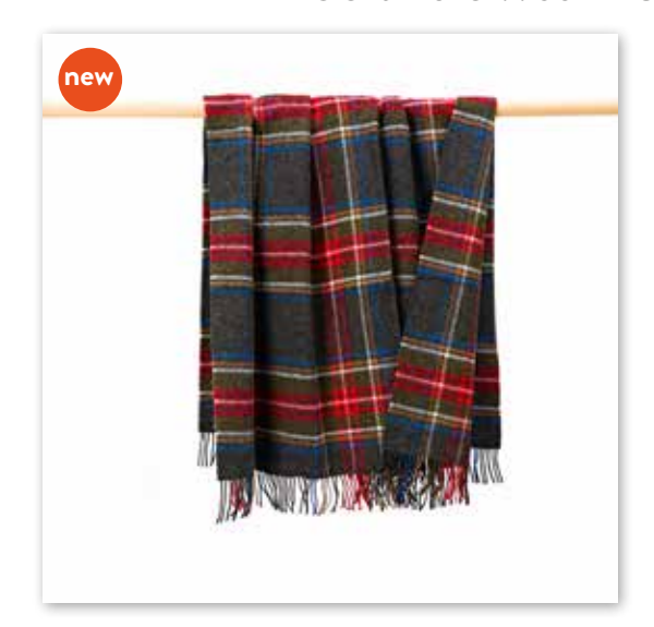
LW101 Grey Red Stewart Plaid

100% Pure Wool - 136 x 180cms (LW) (54" x 71")