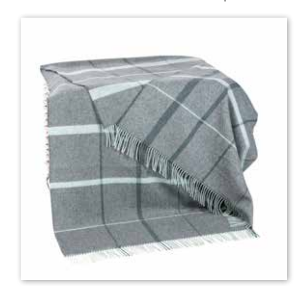
3129 Grey Duck Egg Check