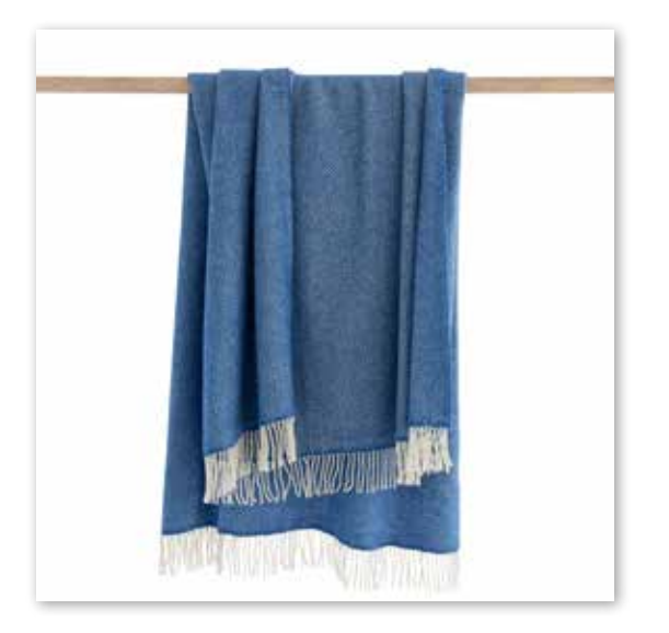
1434 Sea Blues Herringbone

95% Merino 5% Cashmere - 136 x 180cms (54" x 71")