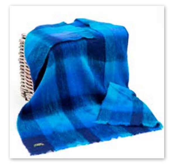
LM503 Navy Blue Aqua Block