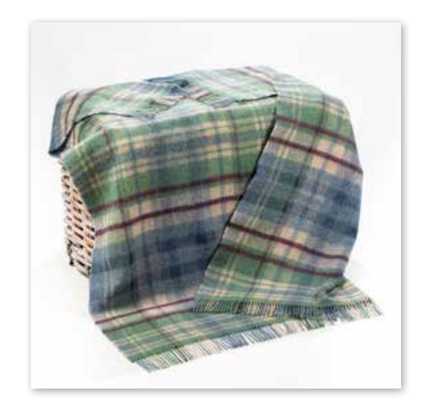
LW100 Denim Green Camel Burgundy Plaid

100% Pure Wool - 136 x 180cms (LW) (54" x 71")