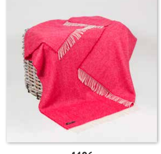
1406 Raspberry Herringbone