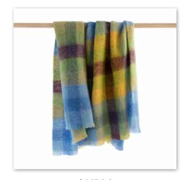
LM506 Blue Yellow Lime Brown Blocks