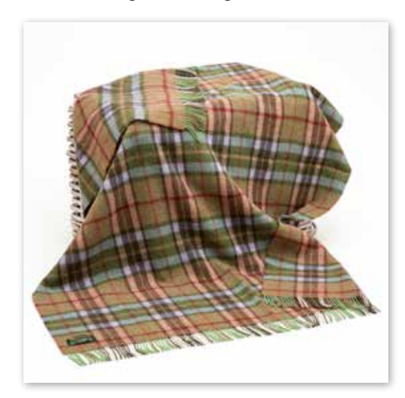
LW186 Pale Green Beige Blue Plaid