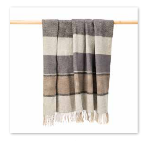
1490 Grey Stone Beige Stripe