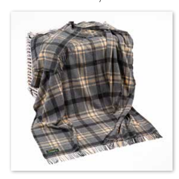
661 Grey Beige Check