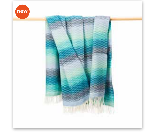
Aqua Teal Denim Blue Diffused Stripe Textured Twill