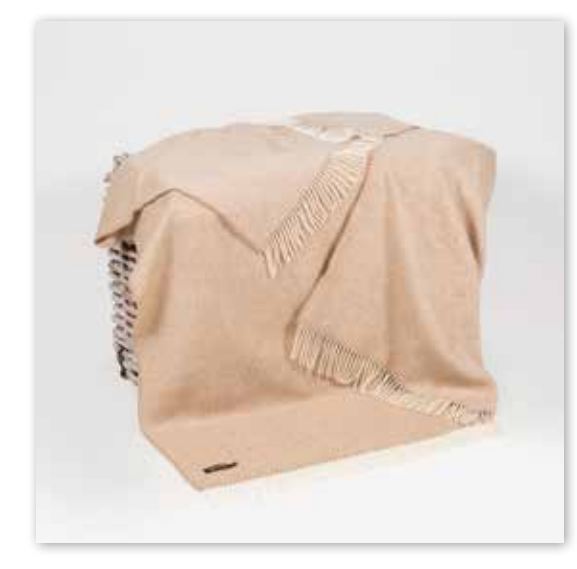
1475 Beige Herringbone