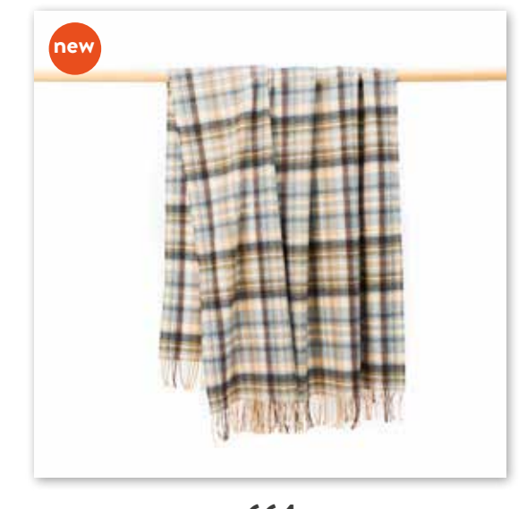
664 Blue Cream Brown Denim Check