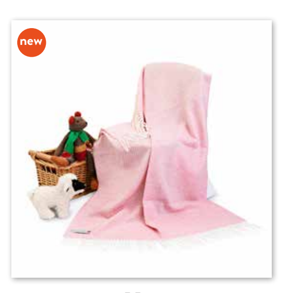
BB22 Pink Basket Weave

Soft snuggly and as warm as a hug, each blanket comes in a uniquely designed box. A beautiful heirloom celebrating baby's beginnings.