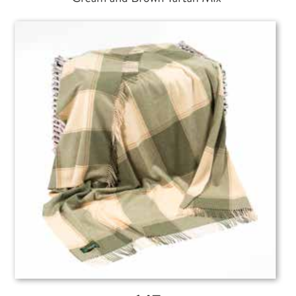
647 Green and Cream Check