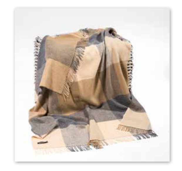
1473 Cream Charcoal Large Block