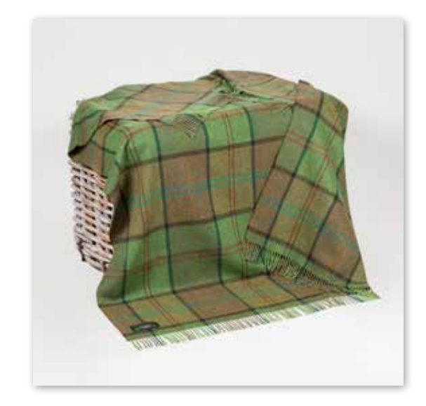
618 Green Earthy Check