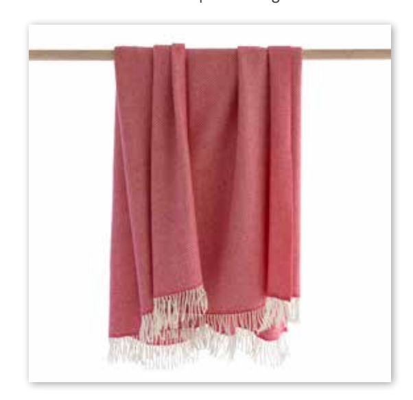
1439 Dusty Pink Bubblegum Herringbone