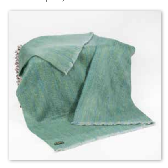
LM521 Pale Green and Blue Plain