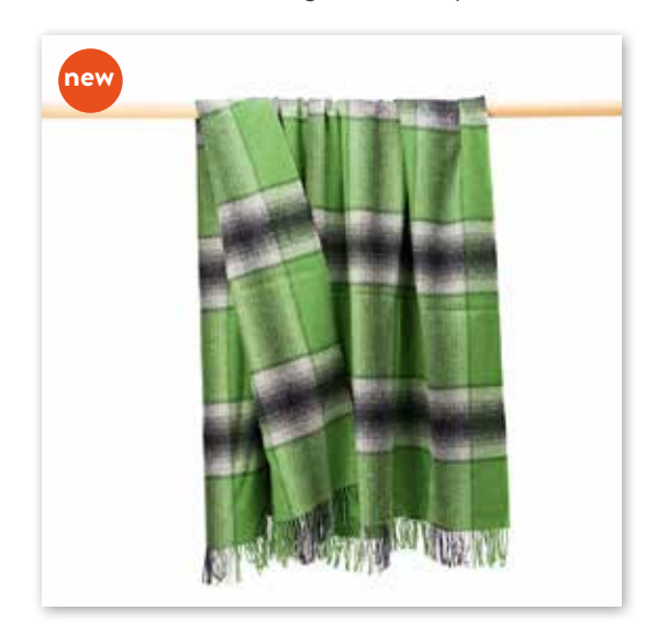
3141 Green Grey Diffused Check